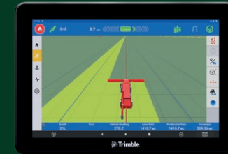
GFX-1060 25 cm (10 in) screen