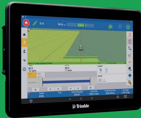
GFX-1060 display 25 cm (10 in) screen

The GFX-1060 display builds on the PTx Trimble history of innovative, user-friendly technology. Thanks to faster processing, greater memory and more storage capacity, this robust display makes handling even the most complex farm operations easy.