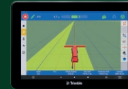
GFX-1060 25 cm (10 in) screen