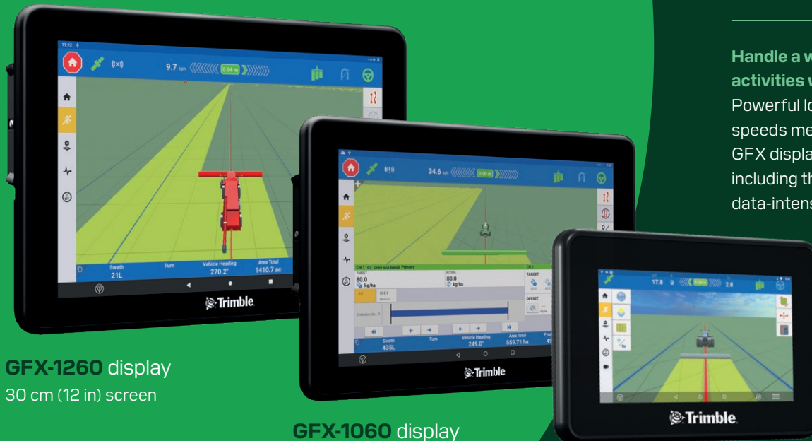
GFX-1260 display 30 cm (12 in) screen

GFX displays easily scale and adapt so you can make hassle-free updates to your screen size, positioning and steering systems, or expanded implement needs.